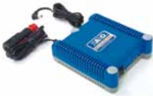
In-transit battery charger BC 10-30 VDC Suitable for 12 V or 24 V vehicle power supplies. Part No. 930 600