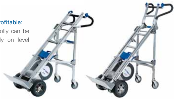
LIFTKAR HD Dolly

Dolly and Fold Dolly can be shifted effortlessly on level surfaces.