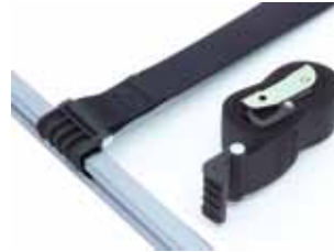
Safety belt – 3.50 m With special hook for safely securing load and heavy-duty metal buckle. Part No. 903 123