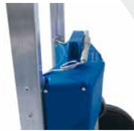
Battery pack retention arm Keeps the battery in place on bumpy ground. Part No. 930 140