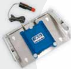
Battery holder with charger unit For charging a replacement battery in a vehicle. Part No. 930 114