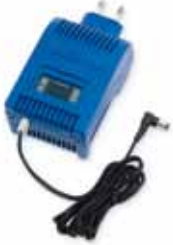
Battery charger BC 100-230 VAC With LCD charging status indicator and battery test function. Part No. 903 606