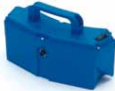
Quick-change battery unit BU Remove and install in seconds. With integrated "On/Off" switch. Part No. 004 110